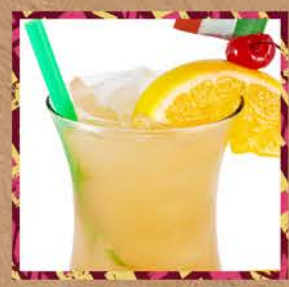
SEX EN LA PLAVA

Mango nectar, tequila and fresh lime. Served frozen.