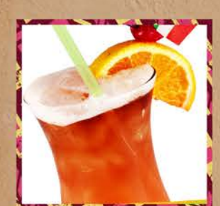
MEXICAN MAI TAI

A mixture of coconut rum, pineapple juice and a splash of Chambord.